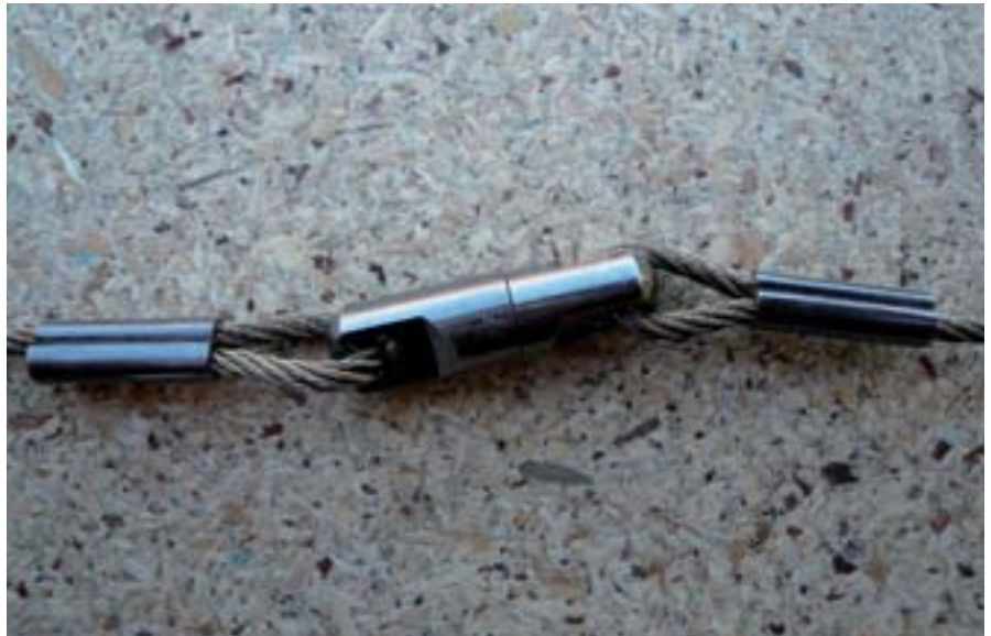
A quality mid-point swivel: small, strong and rotates easily under strain.

We like neat, small swivels: a bulky mid-point swivel spoils the natural line of the snares and makes an obvious and ugly visual distraction. However, experience