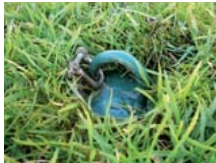
Corkscrew anchor in position.

the captive winding the snare around it. Do not attach snares to posts or natural objects such as trees or saplings – this encourages entanglement which may result in injury or death.