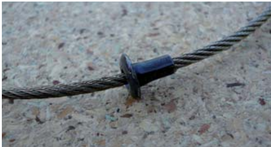
One kind of fixed stop, which prevents the noose closing too far.

head circumferences of a sample of 58 culled vixens of various weights. The smallest noose we could pull over the head of the smallest (4.0kg) adult vixen was 25cm in circumference, but the average was 29cm (for an average vixen weight of 5.2kg). In practice, it seems that live foxes do not pull as hard as we did, perhaps because their ears get in the way. Fox escapes were equally rare whether the stop was set at 23cm or 26cm. But brown hares which ran into the snare